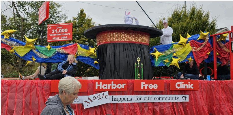
Our Stanwood-Camano Parade float engaged with the community in August.