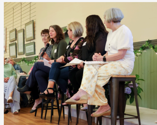
A donor and volunteer panel at the Spring Women's Event.