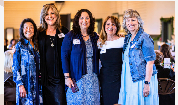
"Be a Part of Our Story" Women's Spring Event