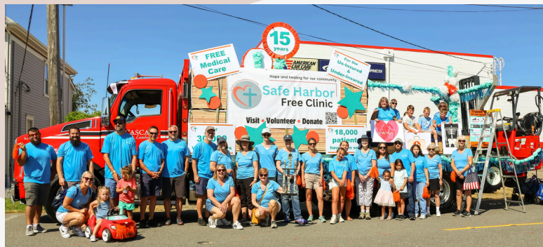
Stanwood-Camano Parade "Best in Show"